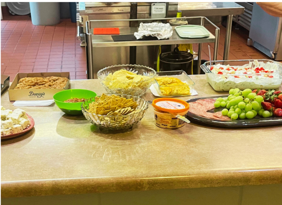
Packing Party Goodies!