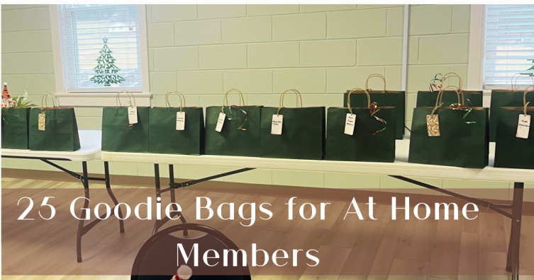
25 Goody Bags for At Home Members