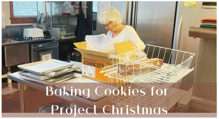
Baking Cookies for Project Christmas