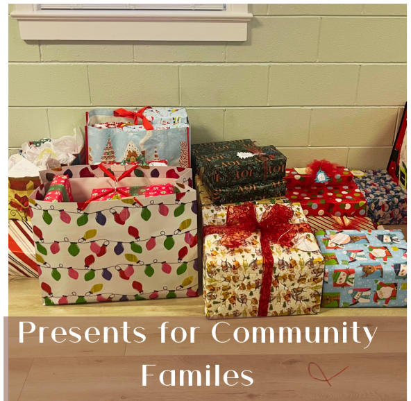
Presents for Community Families