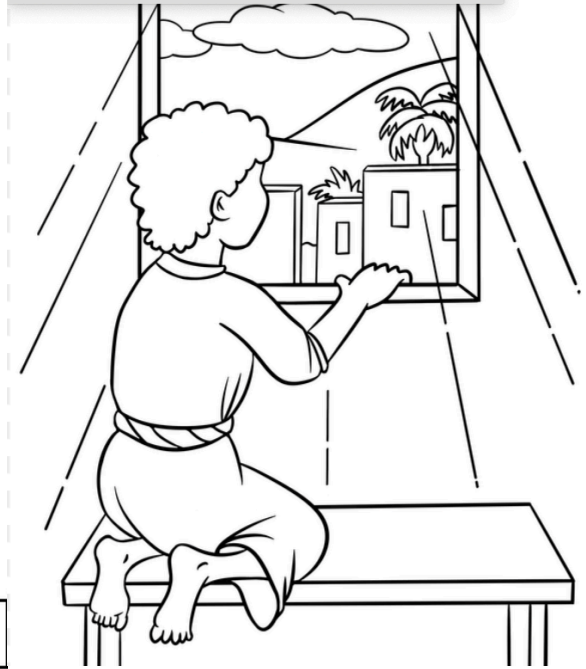
coloring page call of jeremiah - Bing images - details